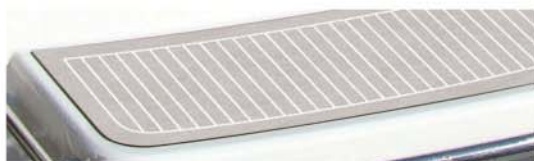
SMOKE / WHITE