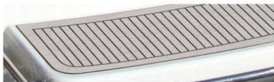
SMOKE / BLACK