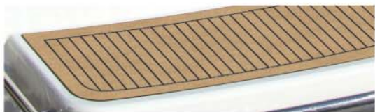
BISCUIT / BLACK