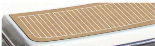
BISCUIT / WHITE