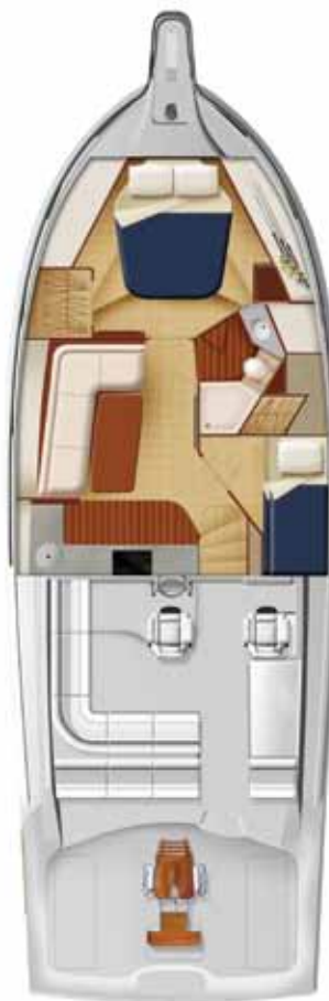
Standard 2 Stateroom 1 Head Arrangement