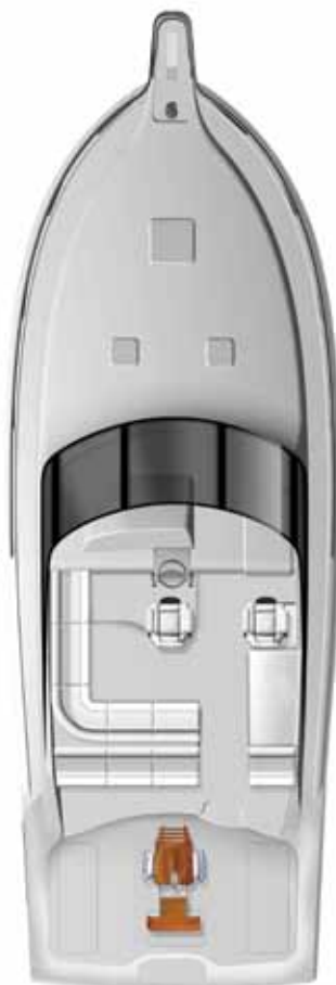
Standard Helm deck and Cockpit