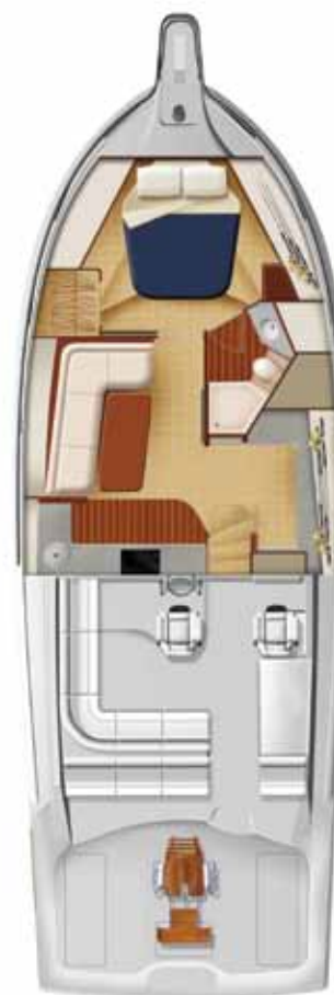
Optional Anglers Room Arrangement