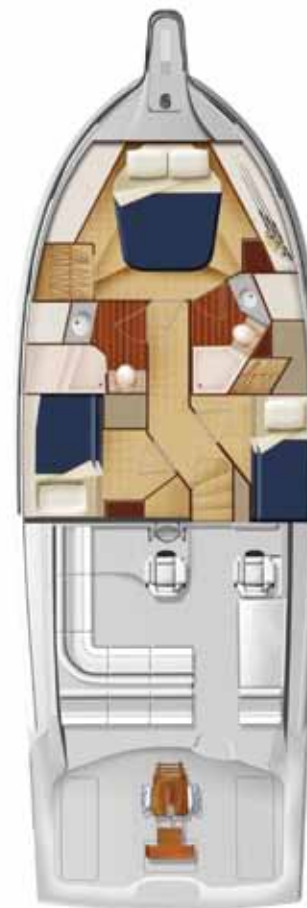
Optional 3 Stateroom 2 Head Arrangement